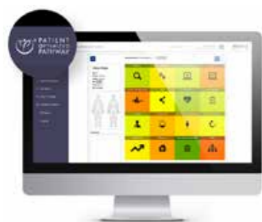
MEDICAL TEAM INTERFACE